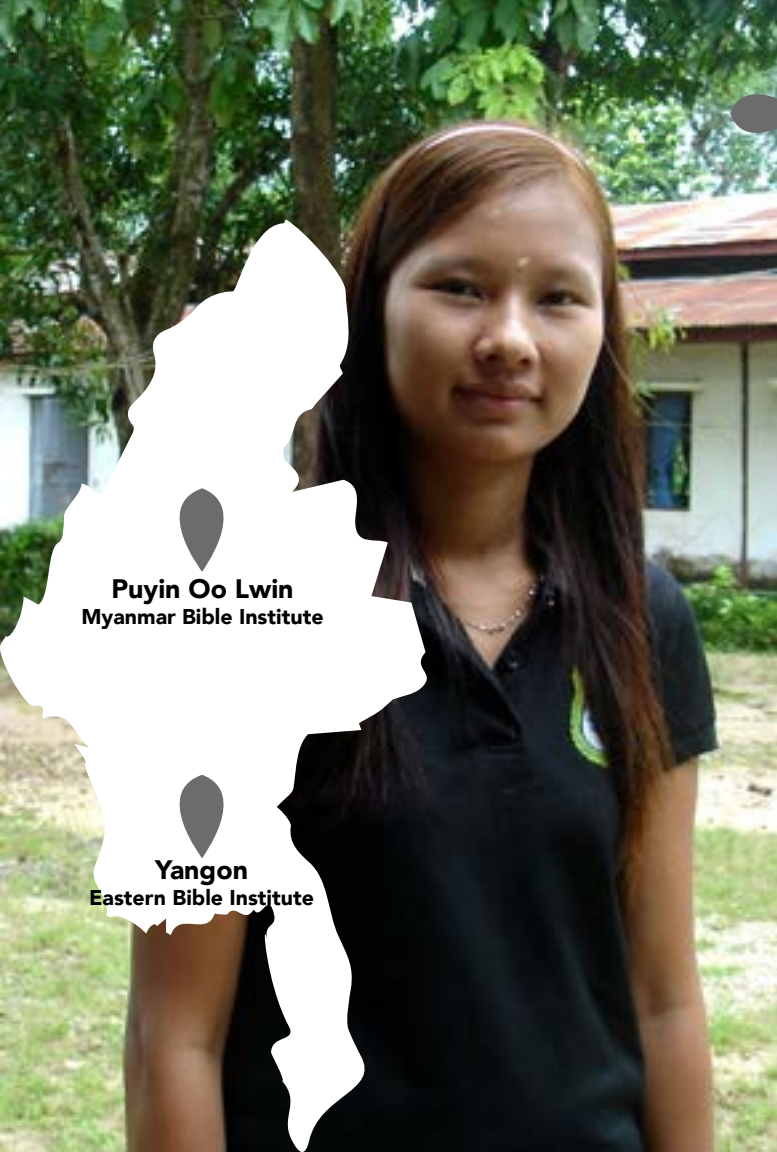
Puyin Oo Lwin Myanmar Bible Institute